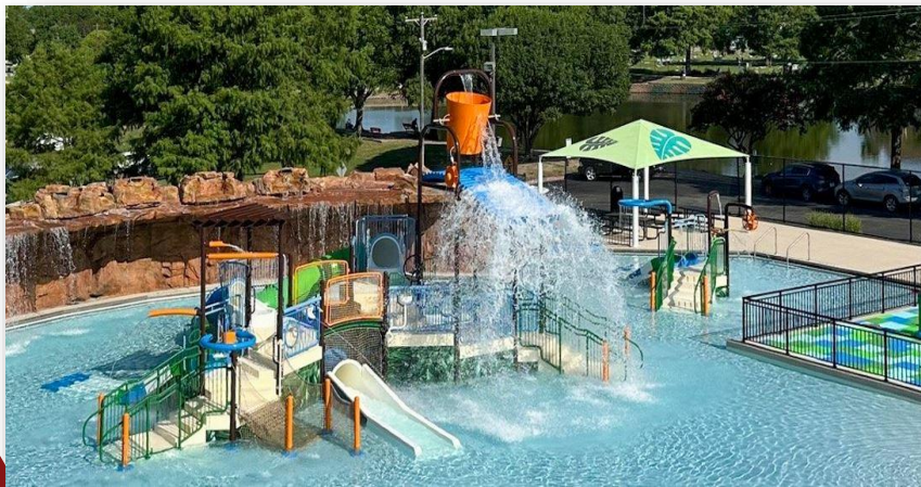
Brunhilde Nystrom City Lake Aquatic Center