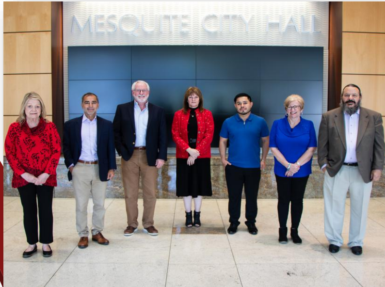
Mesquite Quality of Life Board