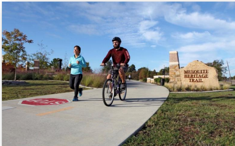
Mesquite Heritage Trail