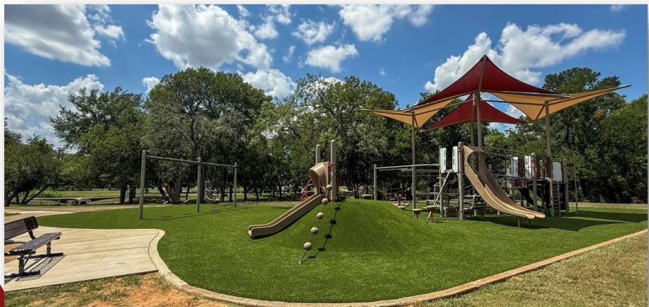
Paschall Park Playground

"The Mesquite Quality of Life Corporation identifies and funds public projects within the areas of Transportation, Public Safety, and Parks and Recreation that maintain and/or enhance the quality of life for Mesquite residents and businesses."