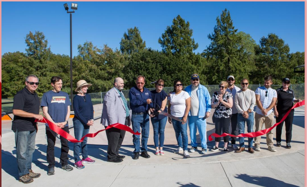
Westlake Skate Park Project Ribbon Cutting Ceremony

Are fiscally responsible and sustainable