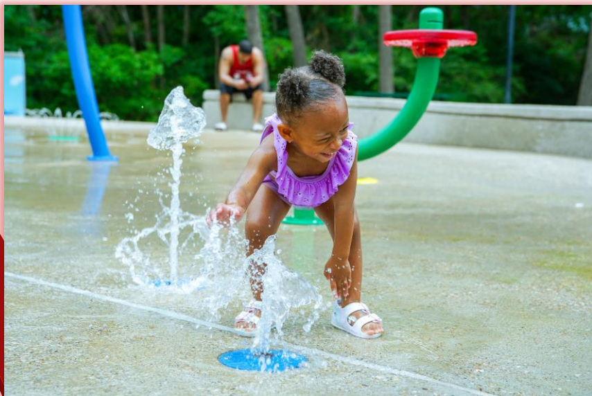
Spray Zone at Clay Mathis Park