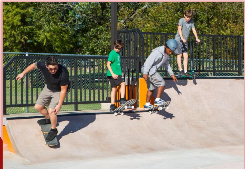
Skate Park opened to the public in November 2024