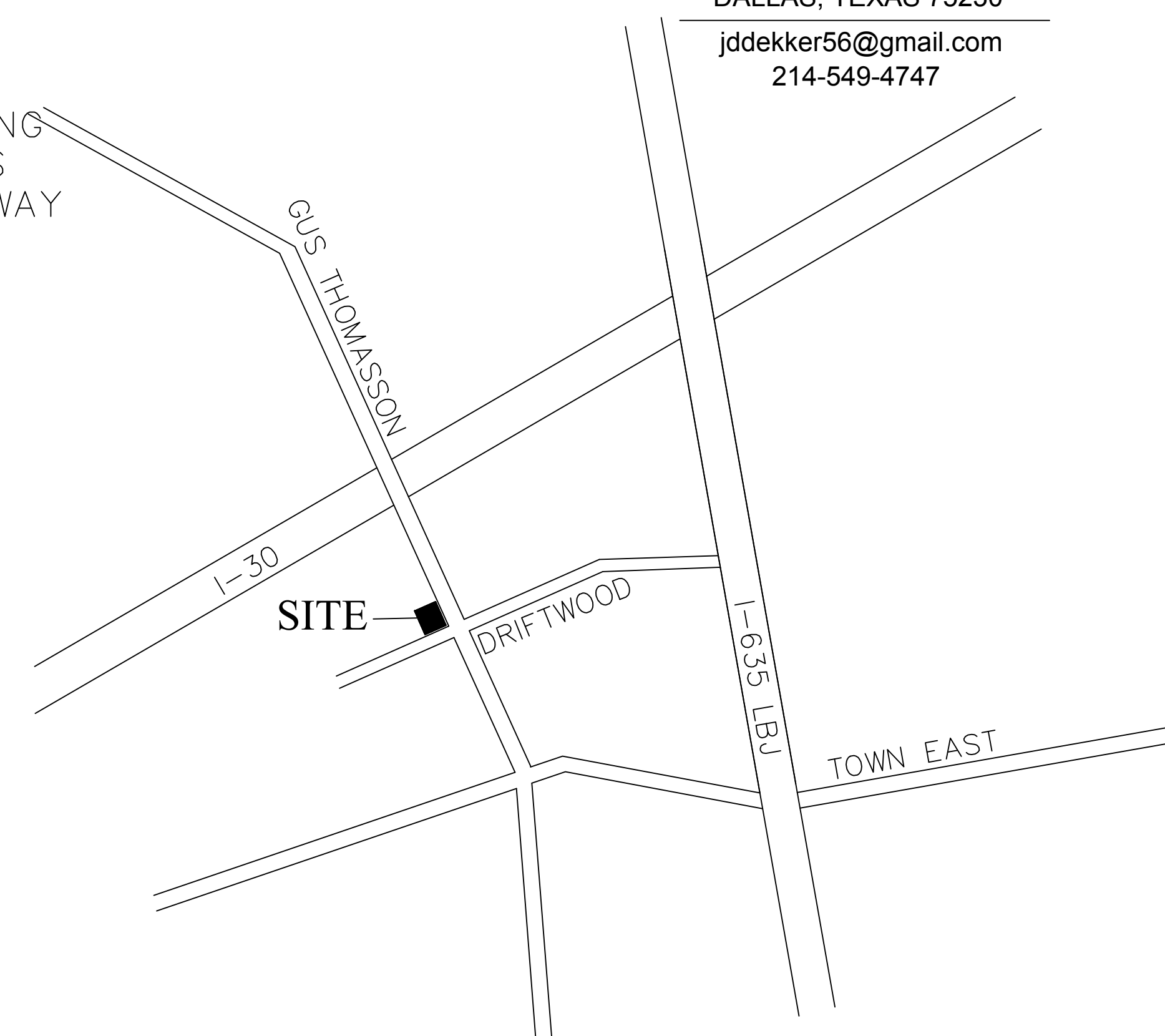
LOCATION PLAN N.T.S.