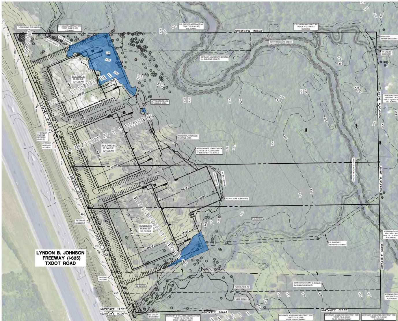
EXHIBIT C – CONCEPT PLAN

LYNDON B. JOHNSON FREEWAY (I-635) TXDOT ROAD