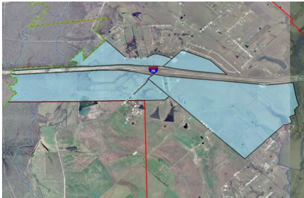
August 2006: 2.2 square miles

Since August 2006, the City Council has annexed approximately 2.8 square miles into the city limits of Mesquite. The area is largely greenfield and is centered within the I-20 corridor in western Kaufman County. Prior to the August 1, 2015, impact fees did not apply in the newly annexed area because there were no roadway projects approved for funding in the city's Capital Improvements Plan. When the new Impact Fee Ordinance became effective on August 1, 2015, roadway impact fees became assessable and collectible in these areas. As of January 1, 2016 water and wastewater impact fees are assessable in the recently annexed areas, as well as the ETJ. To date, no impact fees have been collected in this area.