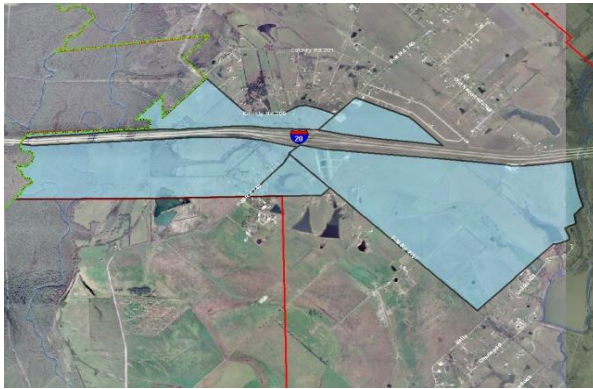
August 2006: 2.2 square miles

Since August 2006, the City Council has annexed approximately 2.8 square miles into the city limits of Mesquite. The area is largely greenfield and is centered within the I-20 corridor in western Kaufman County. Prior to the August 1, 2015, impact fees did not apply in the newly annexed area because there were no roadway projects approved for funding in the city's Capital Improvements Plan. When the new Impact Fee Ordinance became effective on August 1, 2015, roadway impact fees became assessable and collectible in these areas. As of January 1, 2016 water and wastewater impact fees are assessable in the recently annexed areas, as well as the ETJ. To date, no impact fees have been collected in this area.