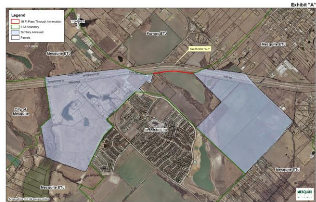
August 2010: 0.57 square miles